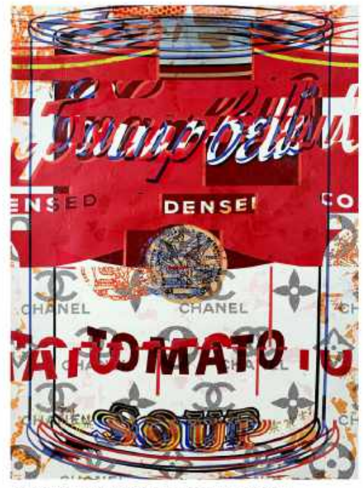
"Campbell's Tomato Soup Disaster in Red" © Taylor Smith, 2021